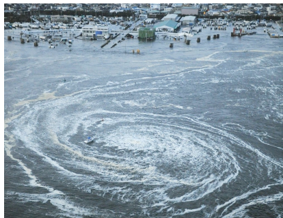
A whirlpool forms off the Japanese coast after the tsunami on March 11.

Images to Live by in 2012! (this is where it gets messy, difficult, let's get our hands dirty!)